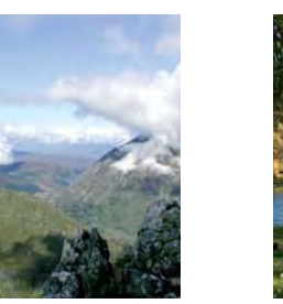
Regents Park, Lon-Ben Nevis from the Devils Punch Bowl. don.